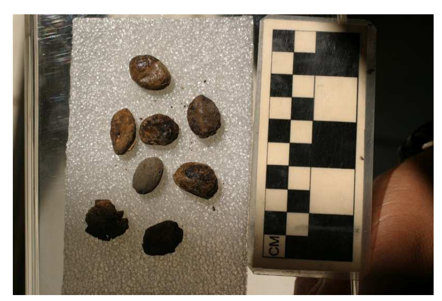
Cacao seeds at the Cerén Museum