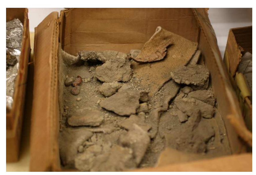
The only box with cacao