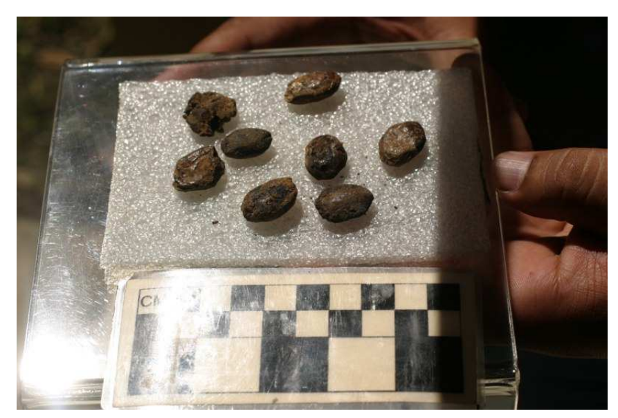
Cacao seeds at the Cerén Museum