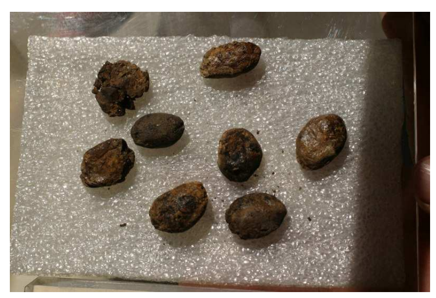
Cacao seeds at the Cerén Museum