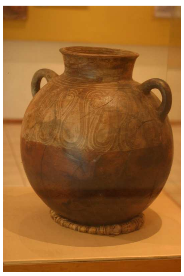
Vase where cacao seeds were found