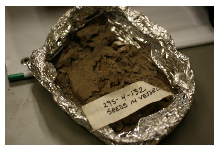
No cacao was found