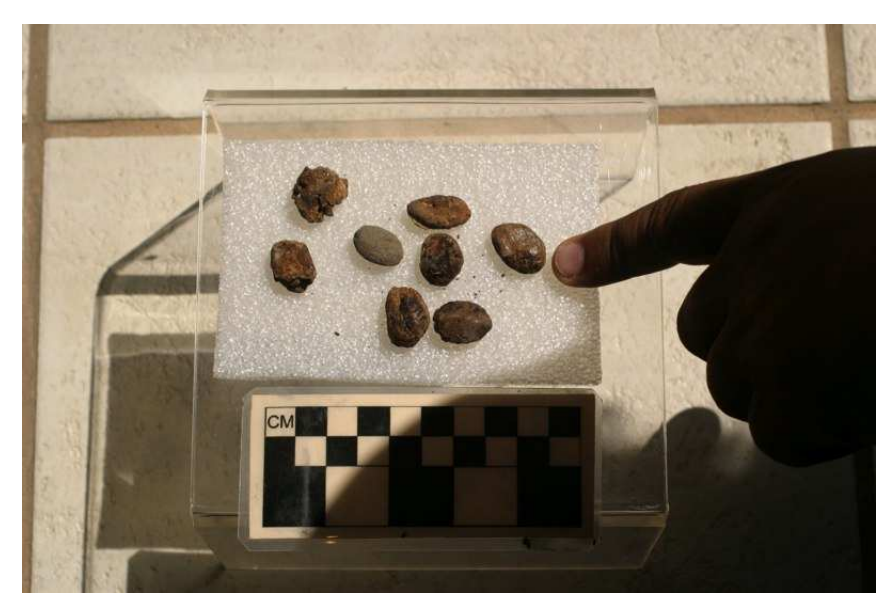
Cacao seeds at the Cerén Museum