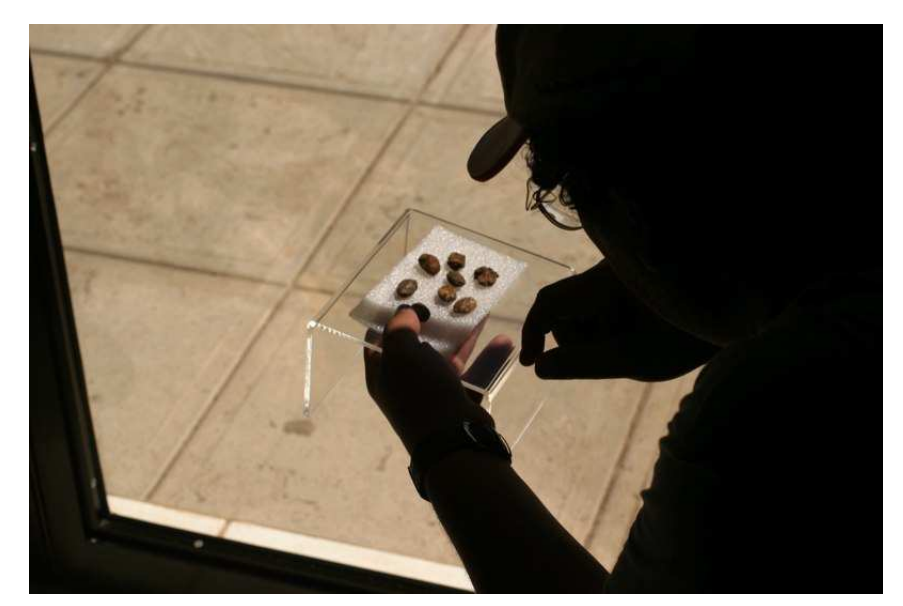
Cacao seeds at the Cerén Museum