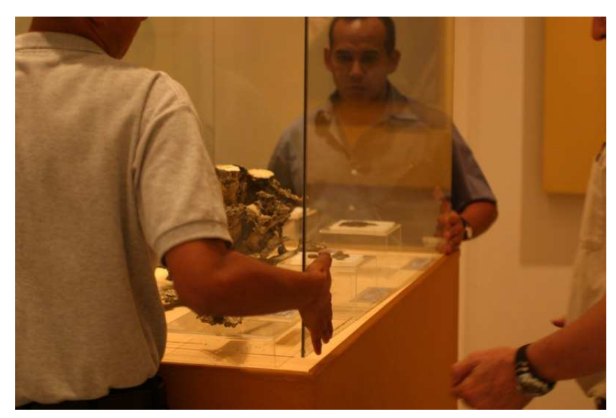
Showcase at the Cerén Museum