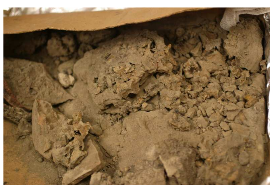
No cacao was found