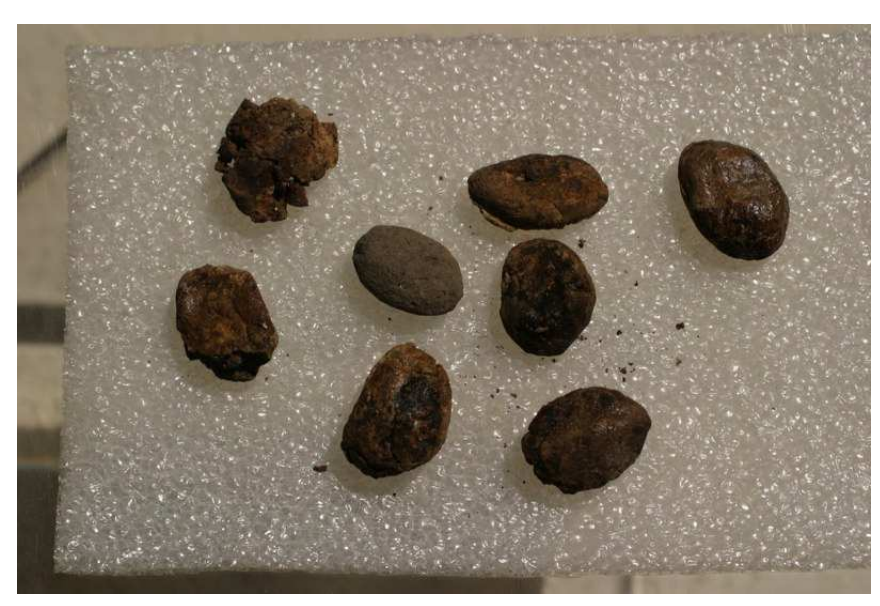
Cacao seeds at the Cerén Museum