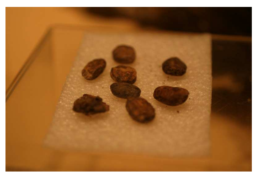
Cacao seeds at the Cerén Museum