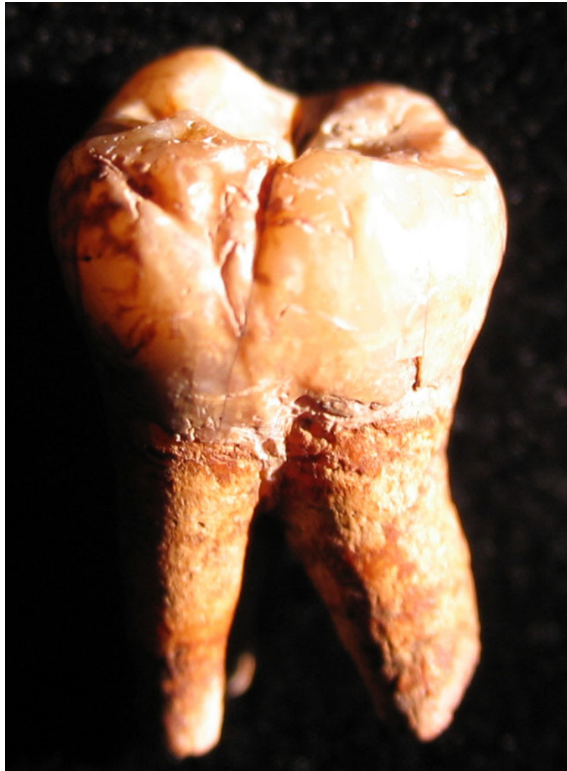
Figure 3. Image of mandibular left third molar from Itzmal Chen mass grave exhibiting unusual protostylid morphology.